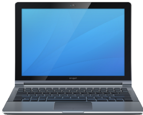
Laptop / Software