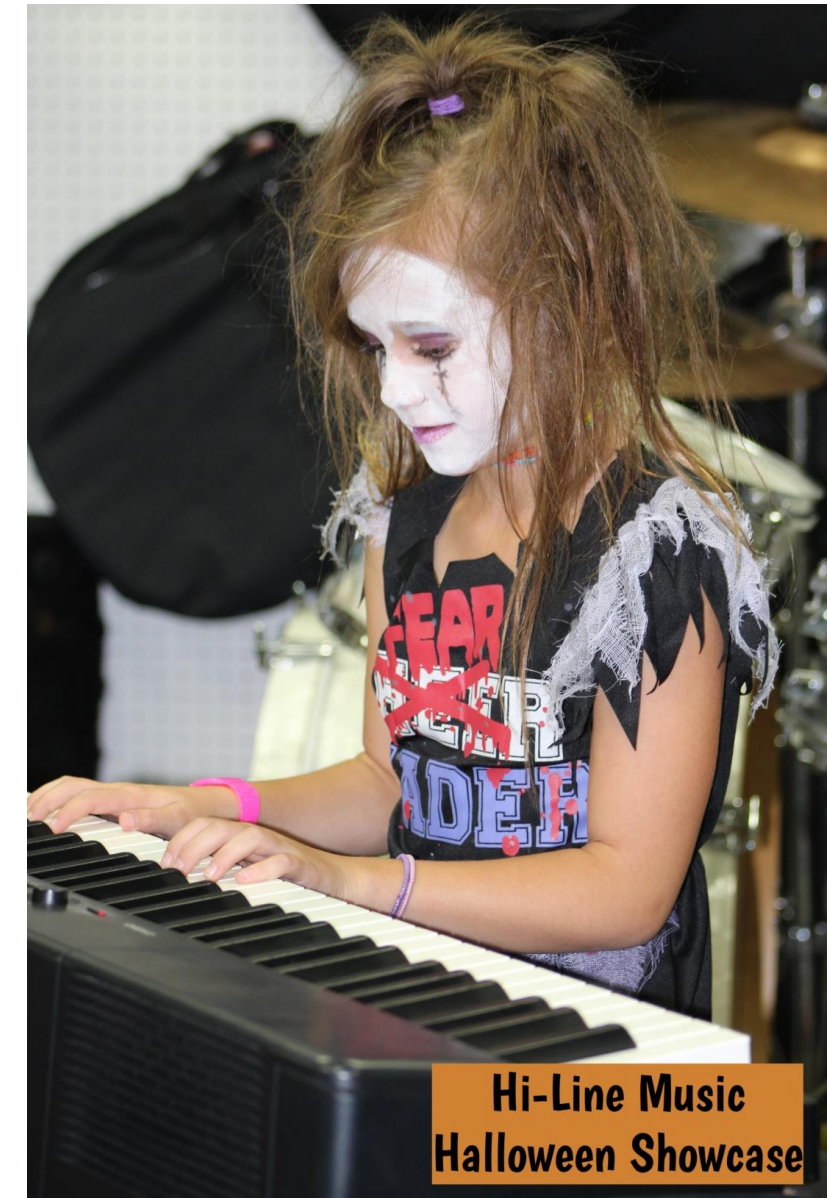
Hi-Line Music Halloween Showcase