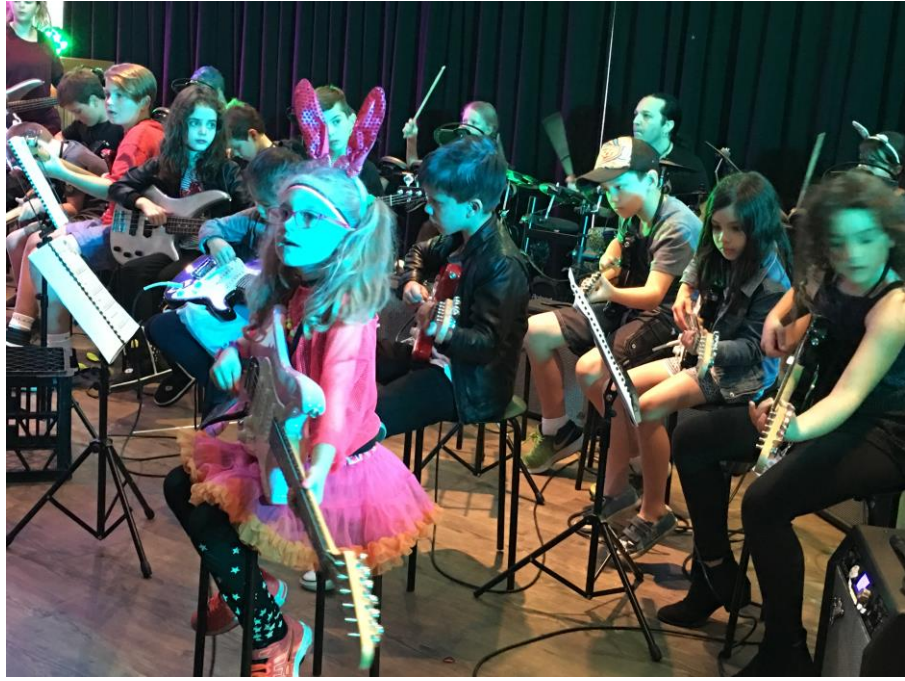
Instant 60% jump in camp enrolments

Summer Camp enrolments doubled from previous year