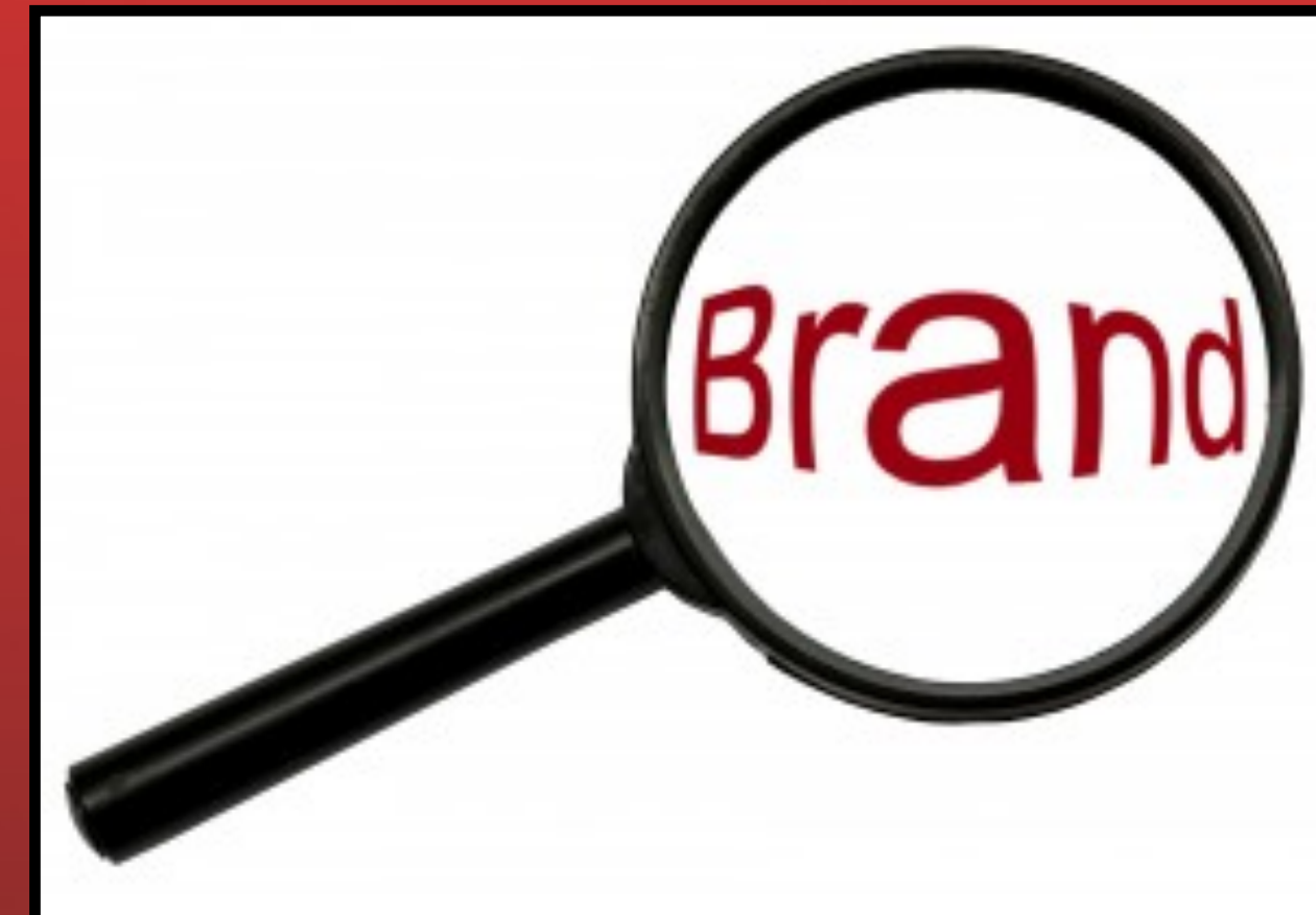
Brand Visibility (Online and in your Community)