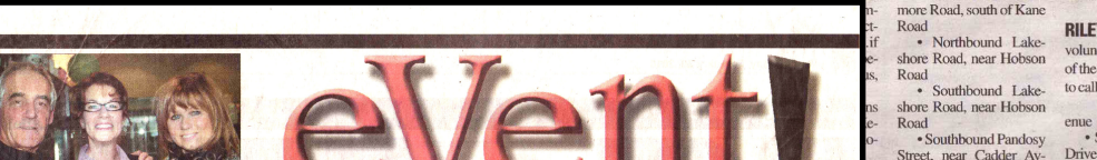
Wentworth Music Education Centre students helped raise more than $150,000 for sick kids at a benefit concert held June 25 at Kelowna Community Theatre. On hand for the cheque donation were...

Rock heroes in waiting Kelowna music students recreate game on stage Students at a local music school are banding together on Mar 6 to play a high-energy tribute to the video game Guitar Hero, in what will be a rock-pool charity extravaganza. Some 130 students from the Kelowna Music Education Centre will perform at the Kelowna Community Theatre on Saturday, June 25, in a tribute to the video game Guitar Hero, in what will be a rock-pool charity extravaganza.