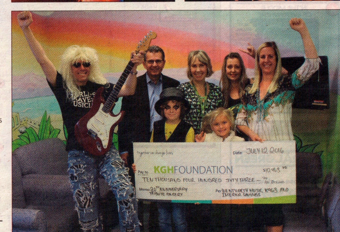
Wentworth Music Education Centre students helped raise more than $150,000 for sick kids at a benefit concert held June 25 at Kelowna Community Theatre. On hand for the cheque donation were...