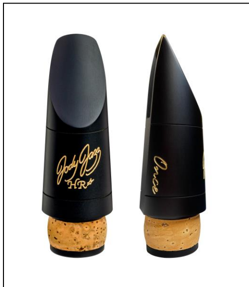
Photo Caption: The New JodyJazz HR* Clarinet 'Once' (11) Mouthpiece.